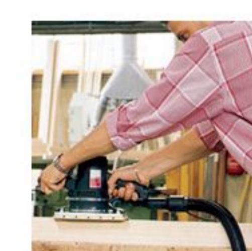
great usage with power driven tools