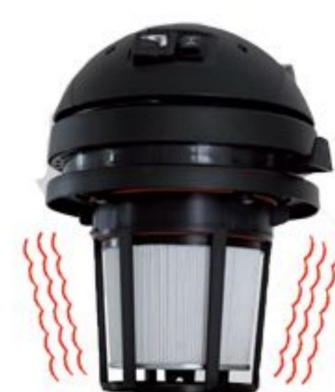
HEPA filter cm 2300 cm 2 with automatic shaker filter