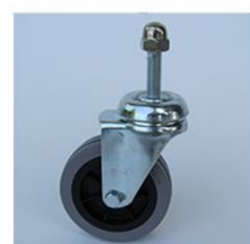
traceless wheel Ø 80 mm