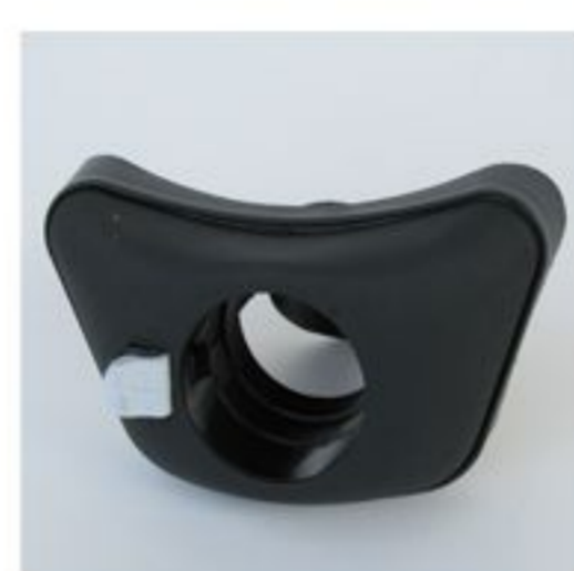
hermetic click no-drop nylon mouth Ø 60