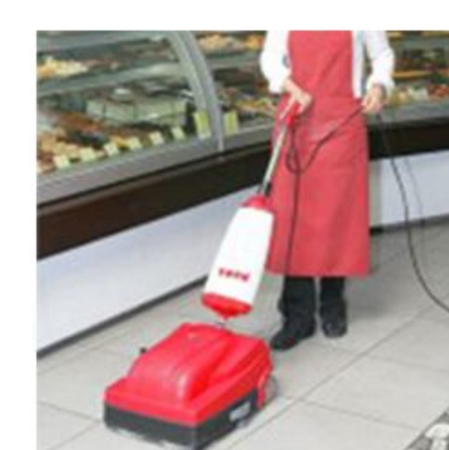
Strong build, easy and compact