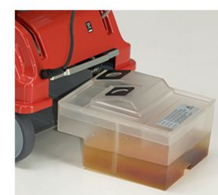
easy removable tank