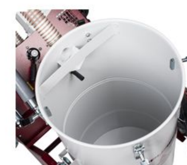
automatic liquid level control