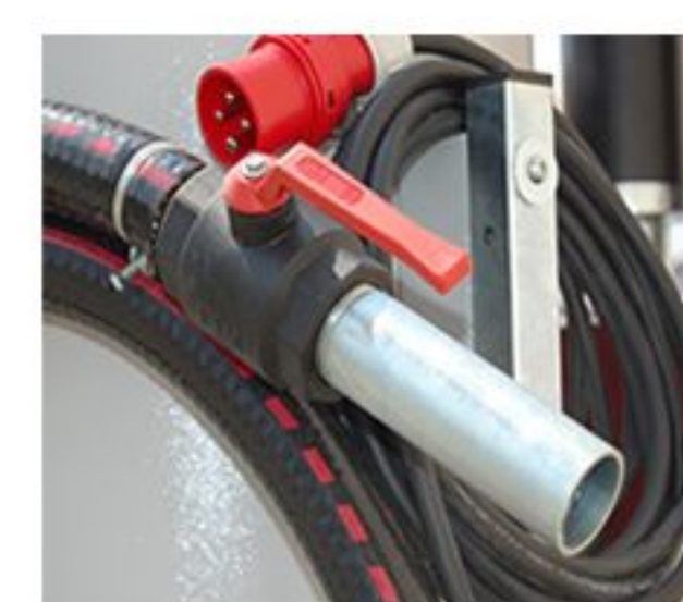
re injection fluids gun