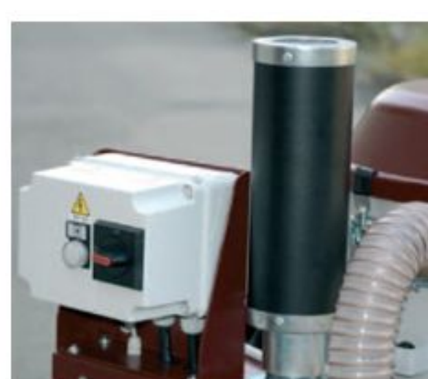
silencer and ON/OFF switch