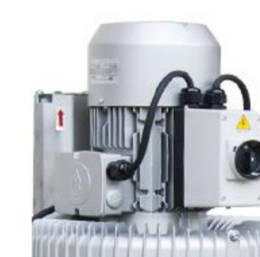
THREE PHASE TURBINE GROUP KW 3