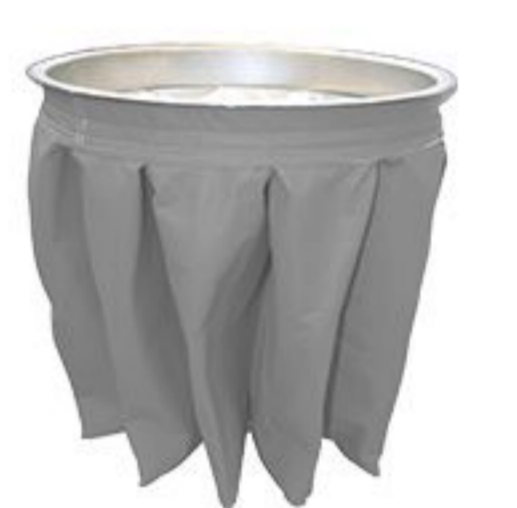
WASHABLE FILTER M CLASS 24.000 CM 2