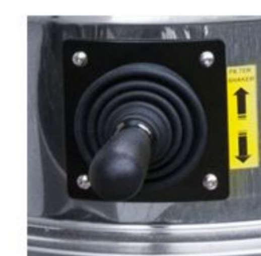
MANUAL FILTER SHAKER