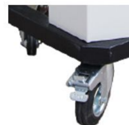
TRACELESS WHEELS WITH BRAKES