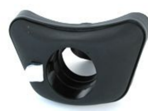
HERMETIC CLICK MOUTH Ø 60